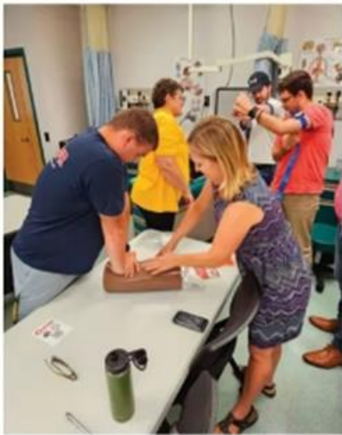
Faculty, staff and students at Millersville University participated in the Stop the Bleed initiative, which aims to save lives by preventing blood loss after traumatic injury.